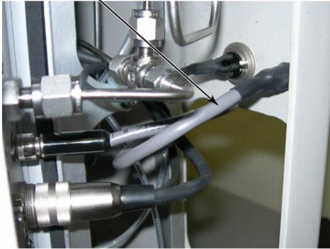
Figure 4: E-DWT internal view detail: 12V grey power cable