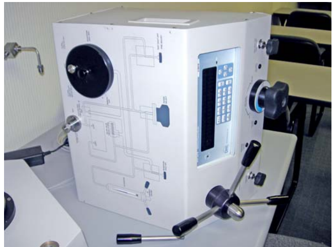
Figure 2: E-DWT on its side with one handle removed