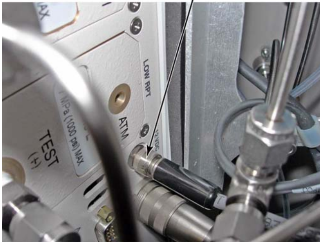
Figure 5: E-DWT internal view detail: knurled nut to RPM4