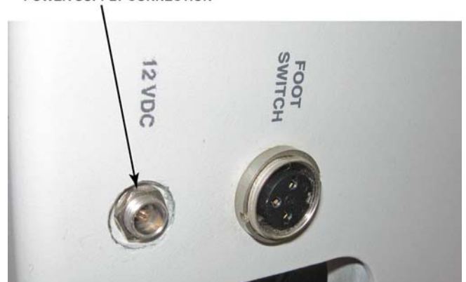
Figure 3: E-DWT rear view detail: power supply connection